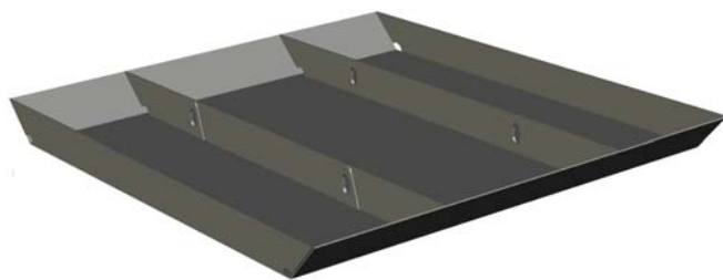
Removable Slag Buckets