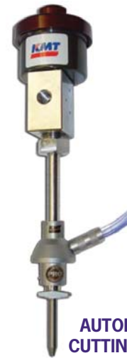
AUTOLINE PRO® CUTTING NOZZLES