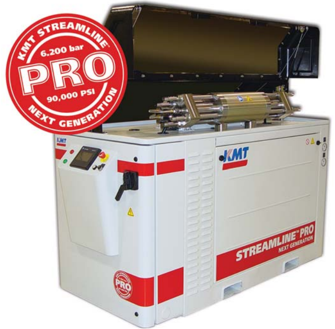
KMT STREAMLINE PRO® INTENSIFIERS

Streamline Pro® and Autoline Pro® are registered trademarks of KMT Waterjet Systems